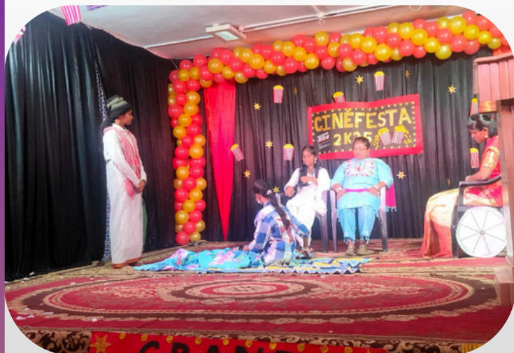
Skit Play at Freshers Day