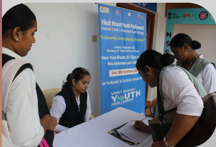
Help Desk: Youth Parliament Registrations in progress