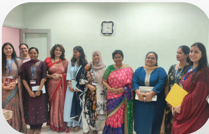
NCW Chairperson with Women team