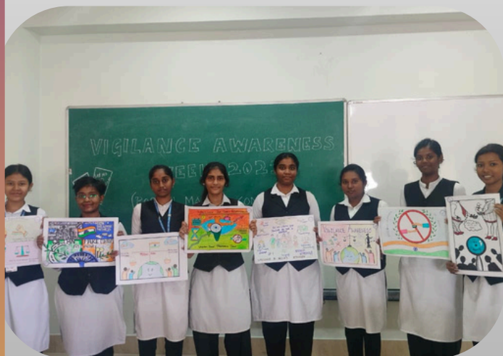
Poster Making Competition Vigilance Awareness Week