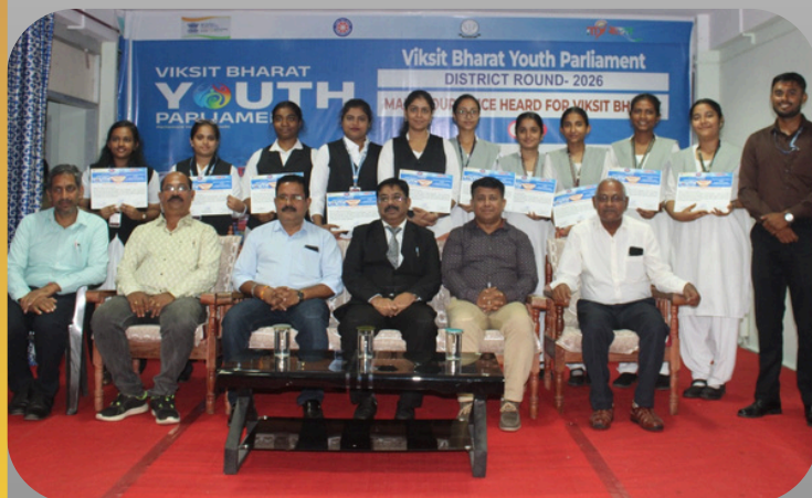
Winners of District Round Youth Parliament with jury members