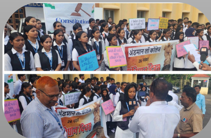
National Law Day Celebration 2025 - Students with Media