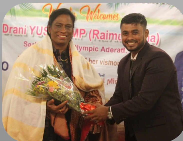
Director of Physical Education ALC honoured Dr. PT Usha, President, Indian Olympic Association.