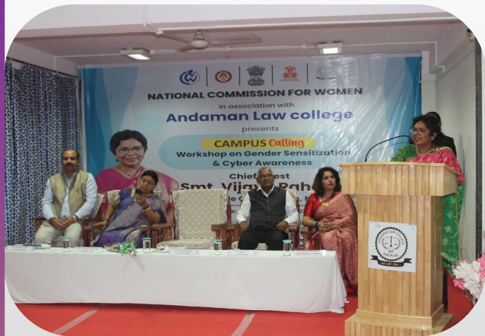
NCW Chief at Campus Calling program at ALC